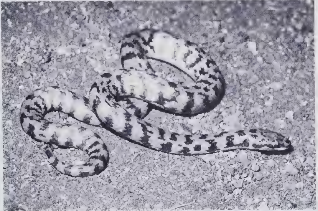
Plate 2: Photograph of specimen of Denisonia fasciata from Dairy Creek homestead.

Ground colour of back buff with many ragged-edged reddish brown bands which are sometimes broken medially or on flanks to form blotches. Belly immaculate (sometimes a few dark streaks on chin shields). Head pale with a dark brown streak from rostral through eye to temporals. Head shields variably edged or blotched dark brown.